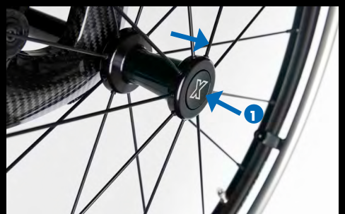
FIG. 9 FIG. 10