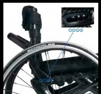
FIG. 6 FIG. 7 FIG. 8