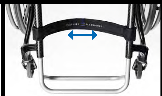
FIG. 3 FIG. 4 FIG. 5