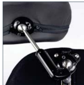
4. Extensive, stepless positioning