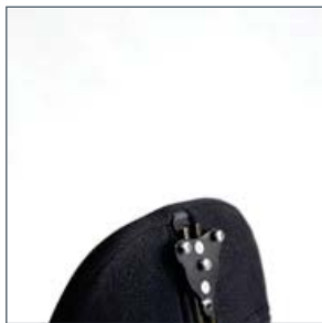
1. Quick release plate fitted