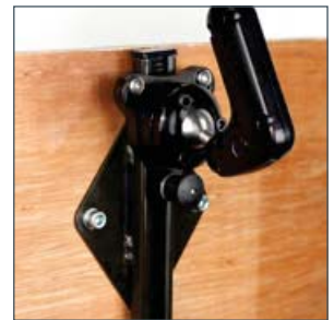
For use with custom made systems