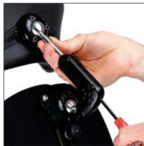
3. One tool for installation & adjustment