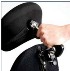
2. Simply slot in the hardware