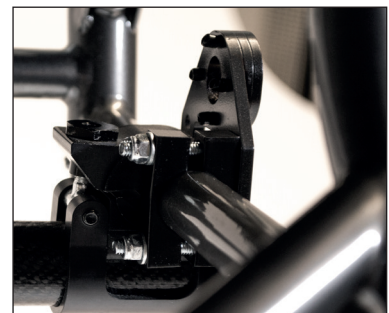
Pic 4: mounted bracket from inside