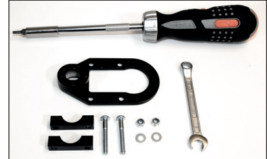
Pic 1: Details for mounting