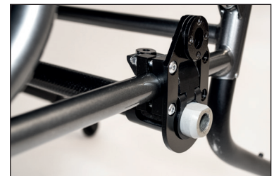
Pic 3: Mounted bracket