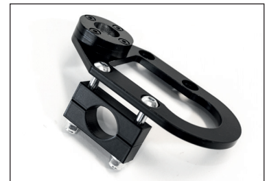
Pic 2: Bracket